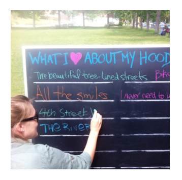
Tell us what you love about your Community Association

Or you can use your own photos - featuring your Community