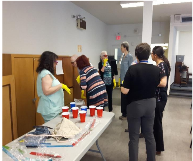
Dementia Awareness Training, The Kerby Centre

Funding support for this project made possible by: