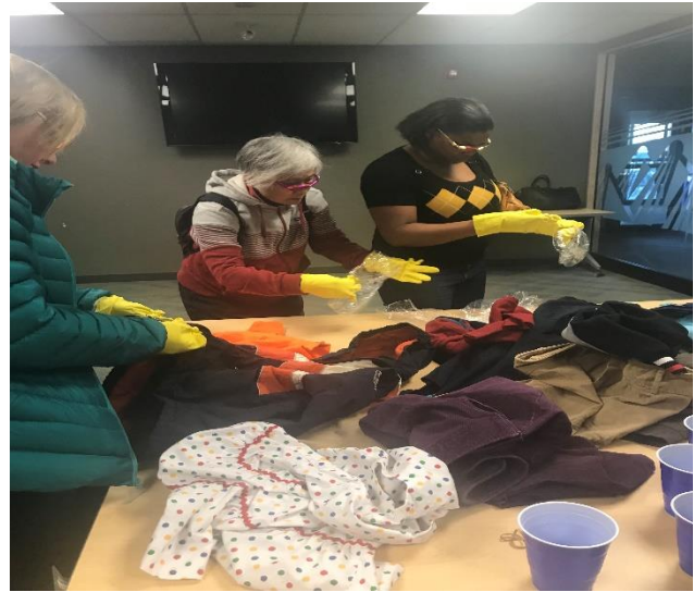
Dementia Awareness Training for Volunteers, Signal Hill Library

For more information on dementia awareness community events, please use the links below: